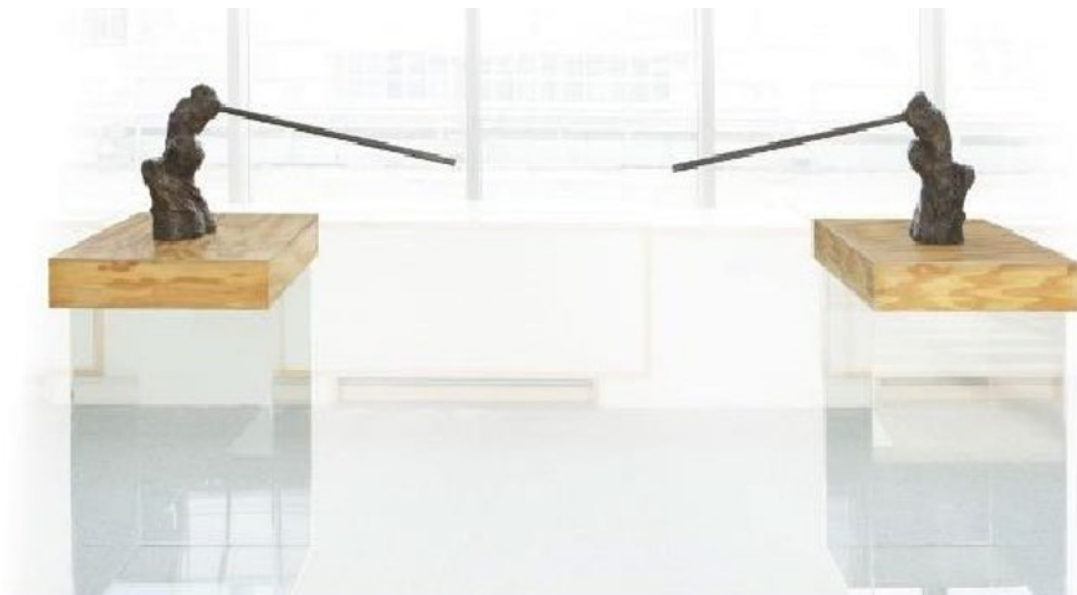
Rui Sanches (*1954) Portugal Seraphita (1989) Bronze on wood base 43 x 92 cm