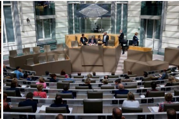
Belgium - Flemish Parliament